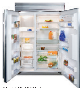
Model BI-48SD shown.