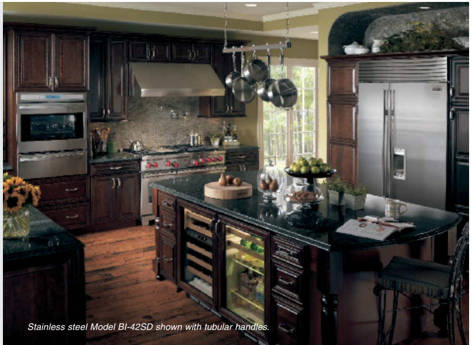
Stainless steel Model BI-42SD shown with tubular handles.

Model BI-42SD offers convenient side-by-side refrigeration along with an ice and water dispenser through the refrigerator door. Sub-Zero dual refrigeration along with new air purification and water filtration systems guard the freshness of your food and water like nothing before. Framed, overlay/flush inset and stainless steel models are available. New flush inset installation allows the unit to sit flush with surrounding cabinetry.