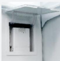
Air Purification System