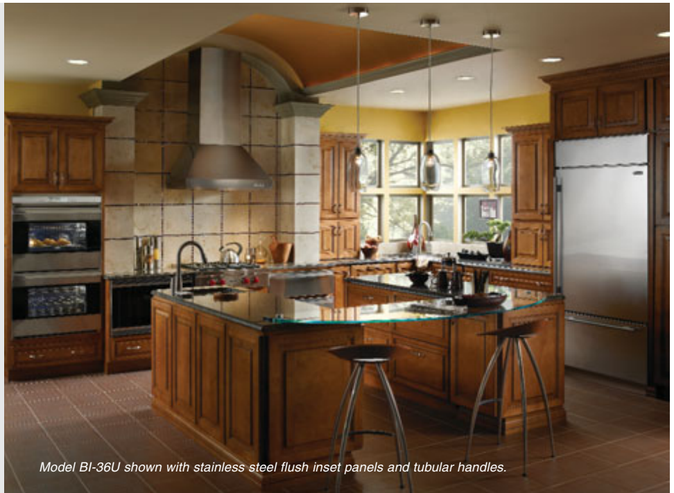
Model BI-36U shown with stainless steel flush inset panels and tubular handles.

Over-and-under Model BI-36U offers large refrigerated storage, plus a convenient roll-out freezer drawer. Sub-Zero dual refrigeration along with new air purification and water filtration systems guard the freshness of your food and water like nothing before. Framed, overlay/flush inset and stainless steel models are available. New flush inset installation allows the unit to sit flush with surrounding cabinetry. Model BI-36U/S is Energy Star qualified.