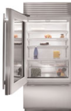
Model BI-36UG shown.