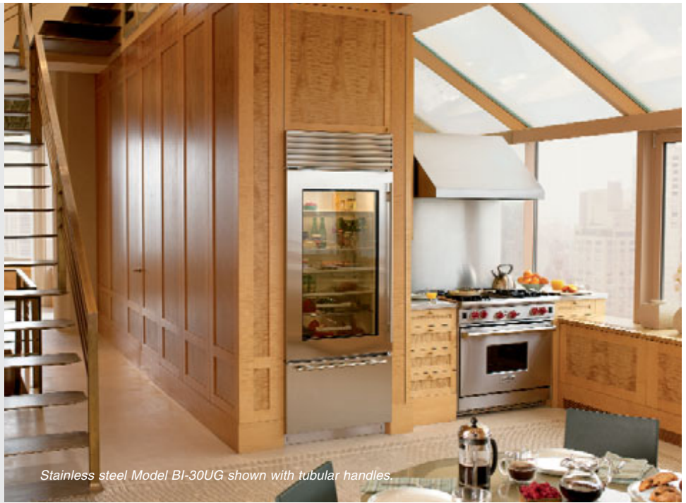
Stainless steel Model BI-30UG shown with tubular handles.

Over-and-under Model BI-30UG offers easy-access refrigerated storage with a glass door, plus a convenient roll-out freezer drawer. Sub-Zero dual refrigeration along with new air purification and water filtration systems guard the freshness of your food and water like nothing before. Framed, overlay/flush inset and stainless steel models are available. A new flush inset installation option allows the unit to sit flush with surrounding cabinetry.